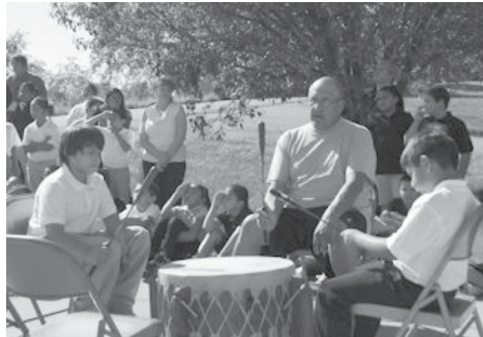
Kateri Drum Warriors

Once the flag raising was completed, the students returned to their classrooms eager to start their first day.