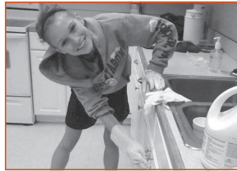
Hard at work, scrubbing the kitchen

projects to help instill pride within the communities. They worked tirelessly to repair the ceremonial Pow-Wow grounds on both reservations and volunteered at the food pantry.