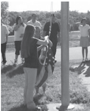
Raising the flag