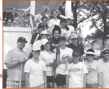
Taking time to smile for the camera

This summer the groups taught two summer Bible camps. One was on the Omaha Reservation and the other on the Winnebago Reservation. The groups also helped with repairing homes in disrepair and community beautification